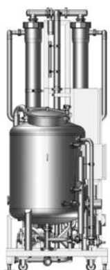
Left side view