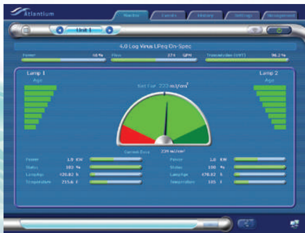
The monitor displays the status of real-time data, including actual dose delivered.

Fully automated and engineered for maximum efficiency, Atlantium's award-winning solution has integrated user-friendly software that meets EPA criteria, for real-time monitoring and control - so you know you're actually getting the dose you need - all the time.