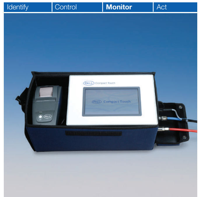
Compact Touch Integrity Test Device CT001

Protect Your Product. Protect Your Brand.